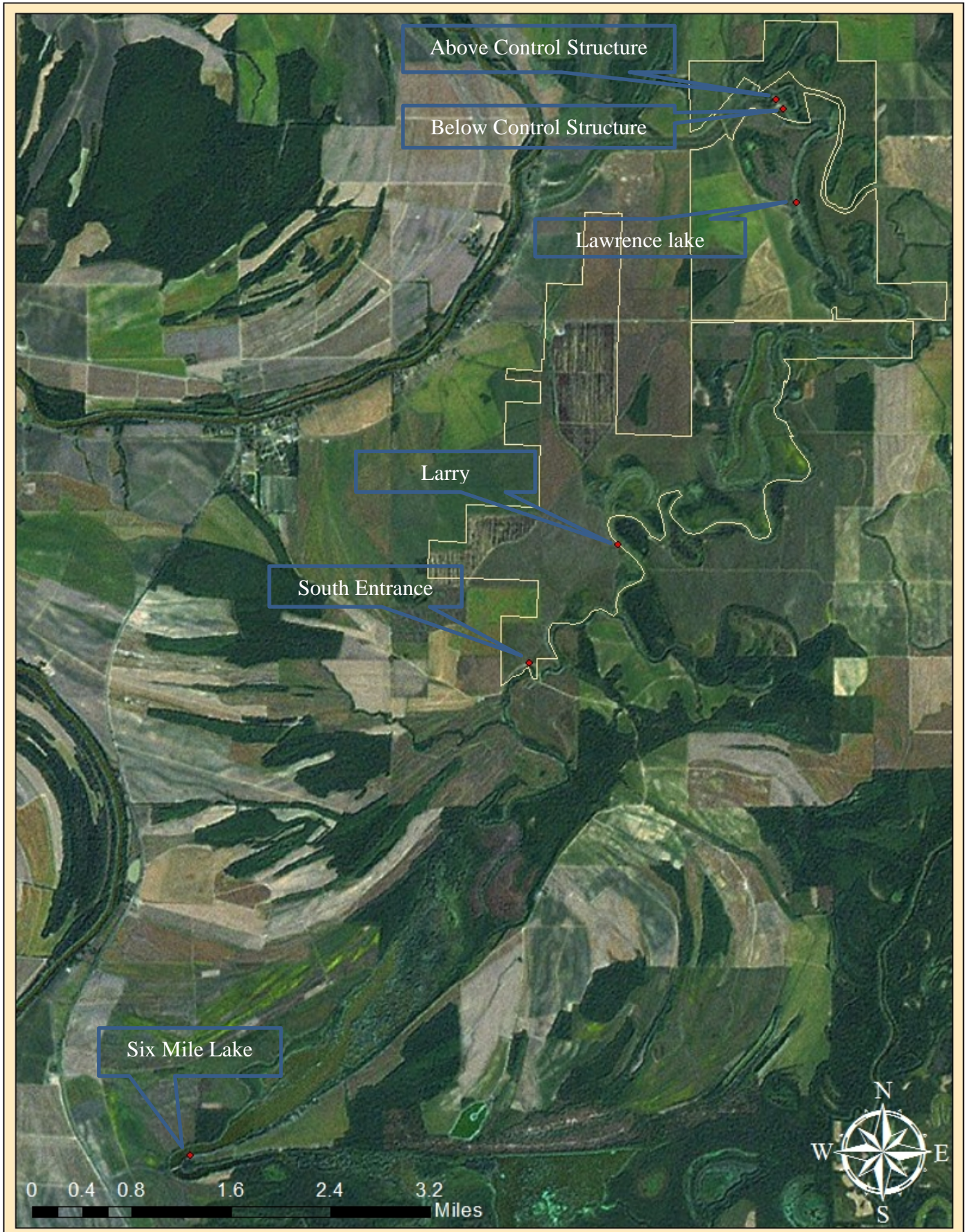
Figure 1 Map of receiver locations and Tallahatchie Refuge boundary.