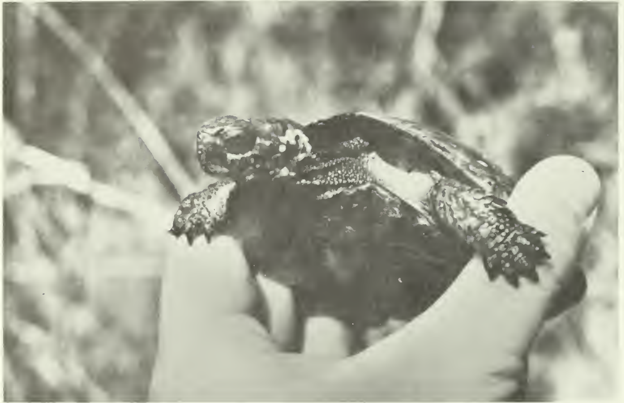
Fig. 1. Adult bog turtle.