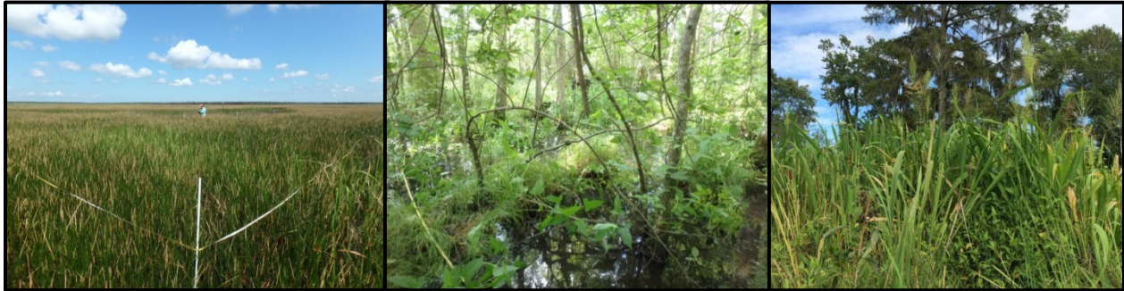
Photos: Resampling a 10 x 10 m vegetation plot in black needlerush marsh at Alligator River NWR (credit: Cassie Cook/USFWS); blackwater swamp forest at Roanoke River NWR (credit: Forbes Boyle/USFWS); freshwater tidal marsh at Waccamaw NWR (credit: Nicole Rankin/USFWS).

For FY17, the three plots at the Lower Suwannee NWR (SWE038) marsh site will need to be resampled. SWE038 was unable to be sampled during the 2016 resample effort, due to Hurricane Hermine, which made landfall during the scheduled sampling period. The three plots at Pocosin Lakes NWR (POC016) will need to be resampled due to plot location error encountered during the resampling date in the summer of 2016.