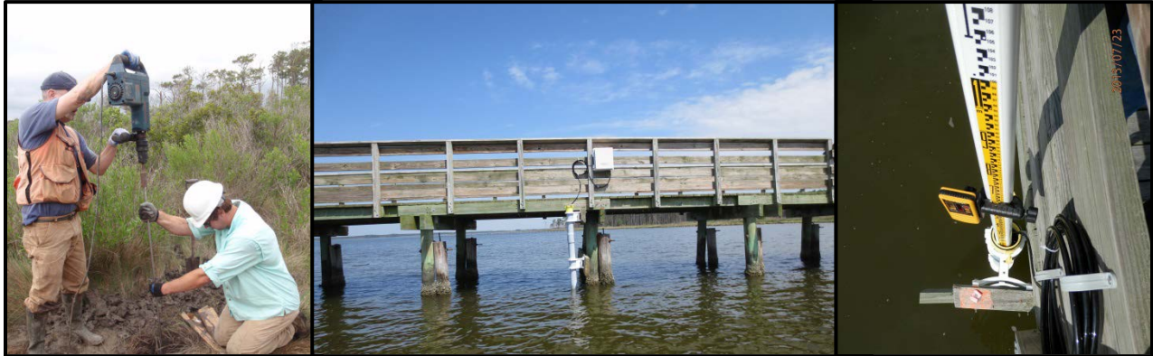
Photos: Installing deep-rod benchmark at Swanquarter NWR; water level station at Bell Island Pier; using a laser level to determine the elevation of the water level station at Bell Island Pier.

In May 2016, an interactive application was developed to visualize and compare the Bell Island Pier water level station data with the Pungo River and U.S. Coast Guard Station Hatteras water level stations. This tool will be used to complete QA/QC of the pilot data and September 2015 – December 2016 deployments in FY17. Then, the data will be submitted to NOAA Center for Operational Oceanographic Products and Services (CO-OPS) to assess if enough data was collected to compute a tidal datum.