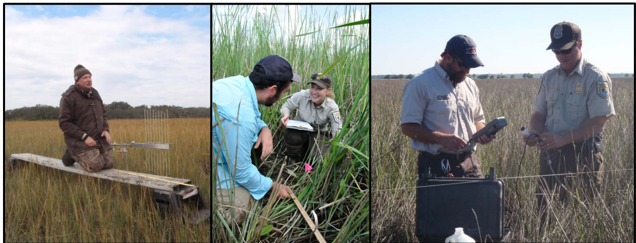
Photos: Measuring surface elevation from RSET benchmark in tidal smooth cordgrass zone at Blackbeard Island NWR (credit: Nicole Rankin/USFWS); nested quadrat vegetation sampling within giant cutgrass marsh on Savannah NWR (credit: Forbes Boyle/USFWS); measuring porewater salinity from tidal black needlerush marsh at Lower Suwannee NWR (credit: Nicole Rankin/USFWS).